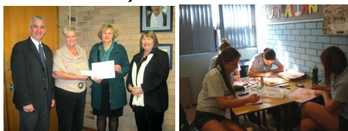
Presenting the cheque to MND representative and Year 11 Business Services students who helped with organisation