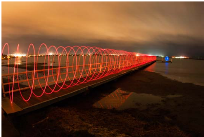
CONNOR SELBY - MERIT CERTIFICATE