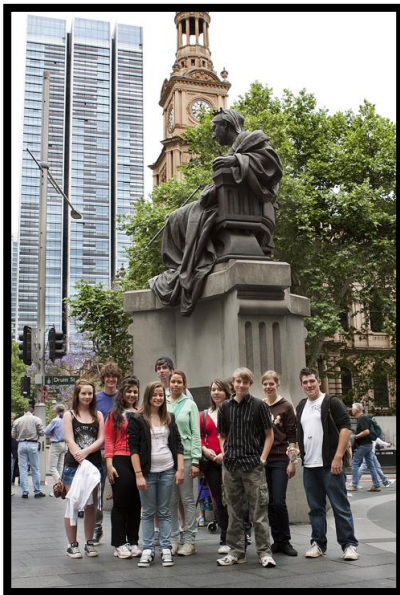
Year 11 Geography students in Sydney